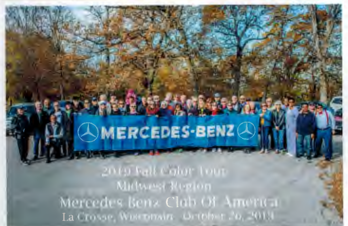
2019 Fall Color Tour Midwest Region Mercedes-Benz Club Of America La Crosse, Wisconsin - October 26, 2019